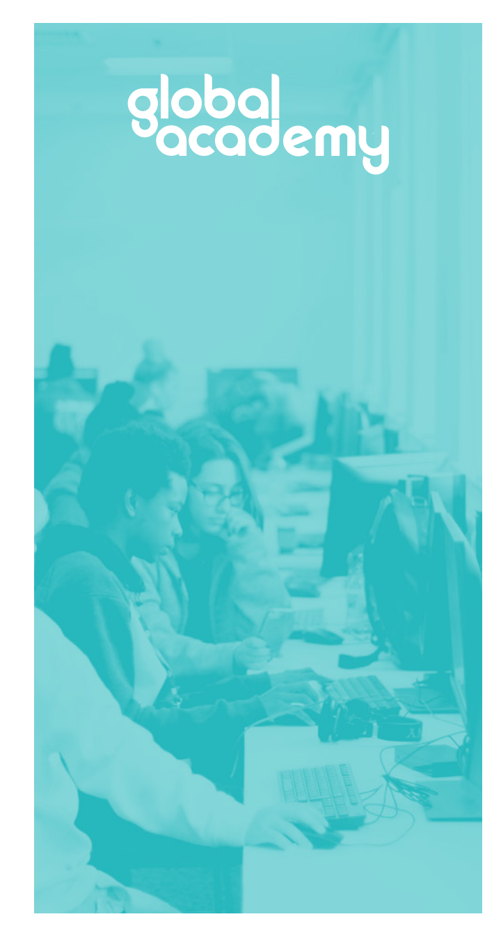
Visitors' Guide to Safeguarding at Global Academy